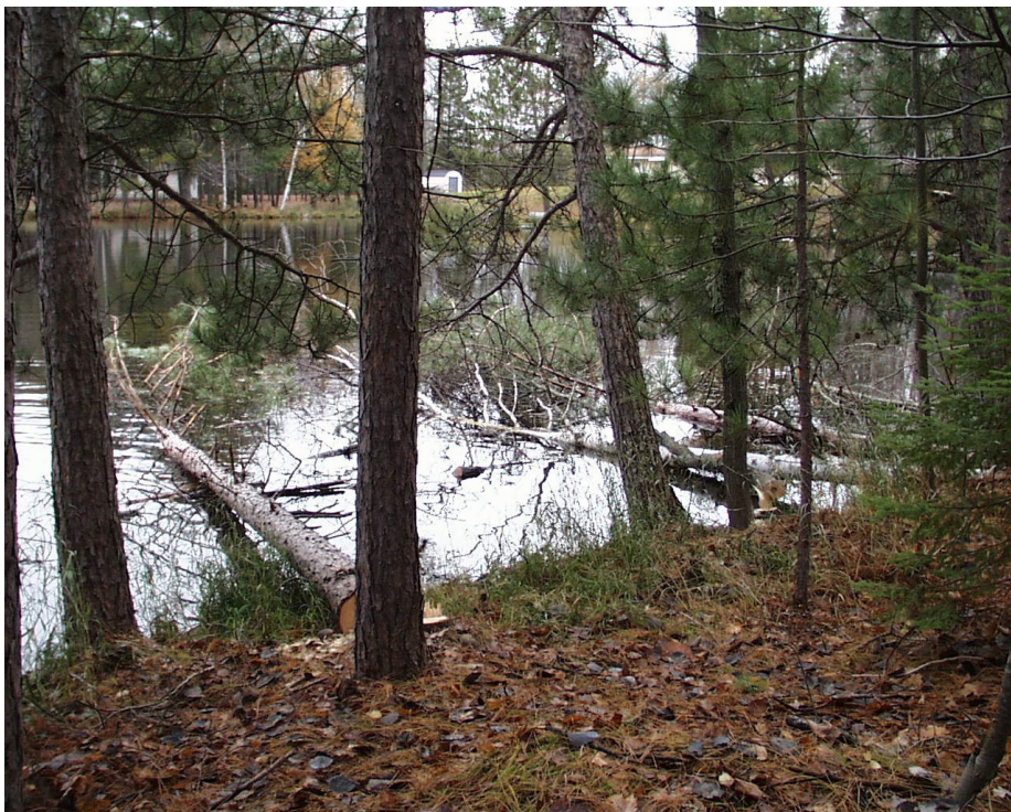
Full trees are dropped into the lake and cabled to shore making favorable fish habitat.

For information, contact the City Clerk's office at 715-339-3125.