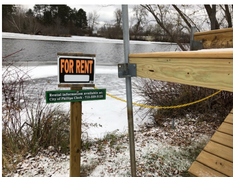
The rental docks are removed from the lake for the winter

Bill Ruff continues to lead our very successful Fish Sticks shoreline habitat improvement program. Bill and his volunteers have placed 47 structures over the past 5 years, and have another 20 planned for this coming spring. If you’re interested in having some “sticks” placed along your shoreline in the spring of 2021, give Bill a call at 715-339-3680, email wjrruff@pctcnet.net .